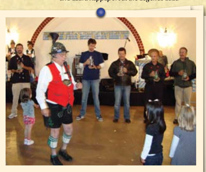
German Fun and Games with The Edelweiss Band at Oktoberfest