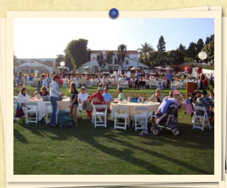
Fourth of July Celebration