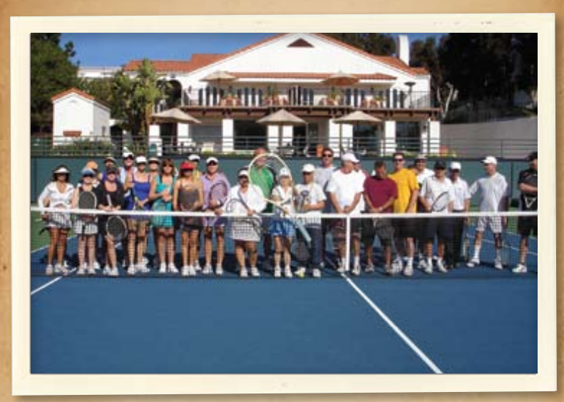
Tennis Members on Center Court

Stop by and see our newly renovated Tennis Pro Shop! Updates include hardwood flooring, new interior paint, granite countertops, new cabinets, and new retail displays. We are proud to step into the next era of tennis at La Costa with our best face forward!